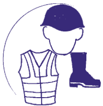
Hat, Hi-vis, Boots

Please ensure that you bring all your PPE to site. Aoraki Construction sites require the following PPE.